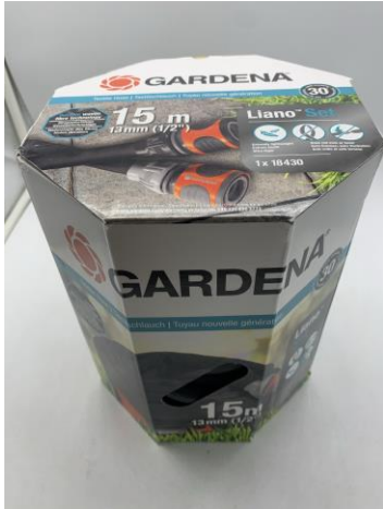
Gardena G18431-15 Standard